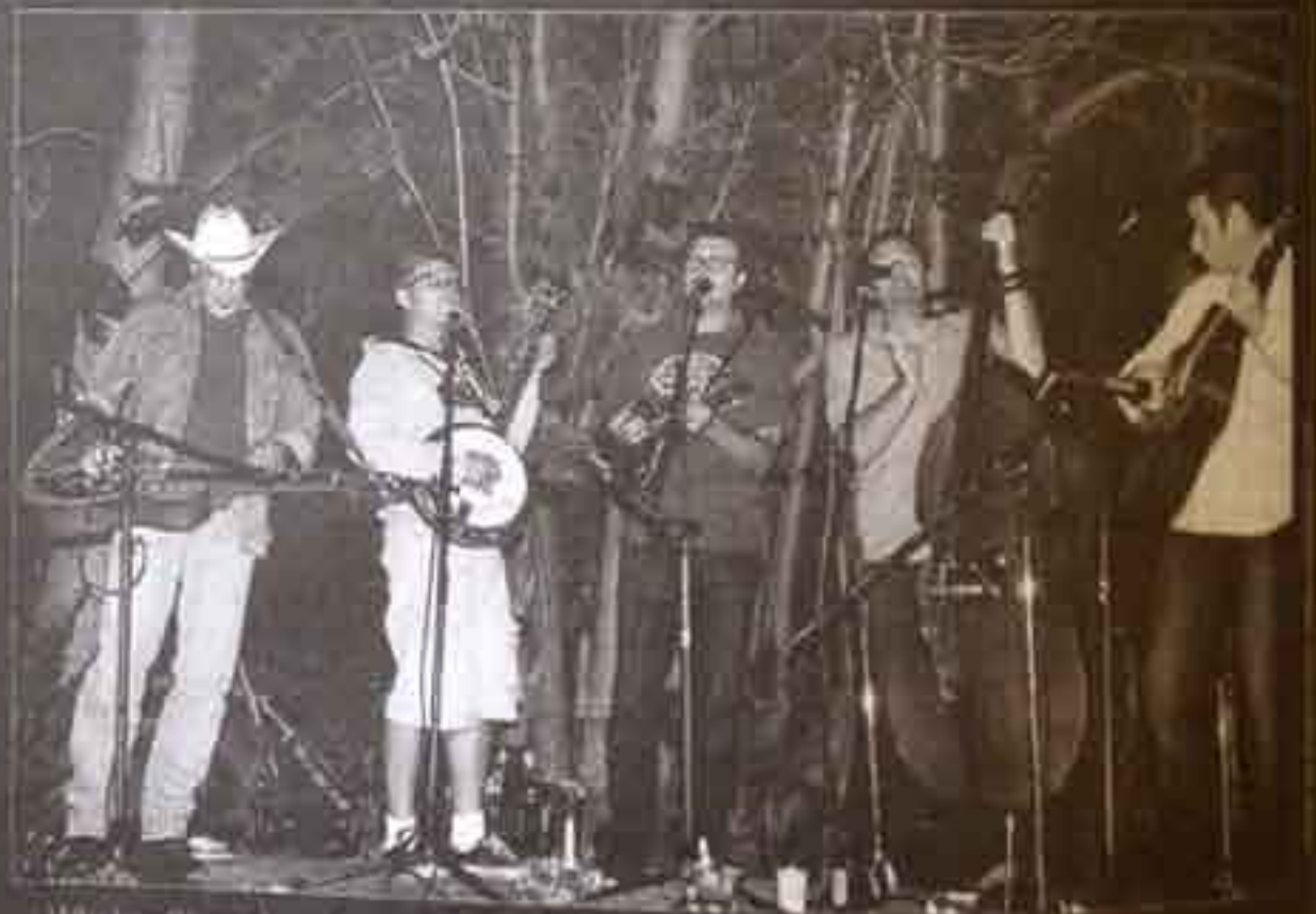
Whiskey Champ brought its manic bluesgrass to Farmer and the Cook in Doe and Marshall.