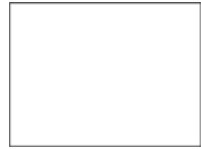
Hawaii Luxury Magazine

Info | PDA/Text | Corrections | Calendars | Movies Obituaries | Vital Stats | Weather | Surf | Subscribe